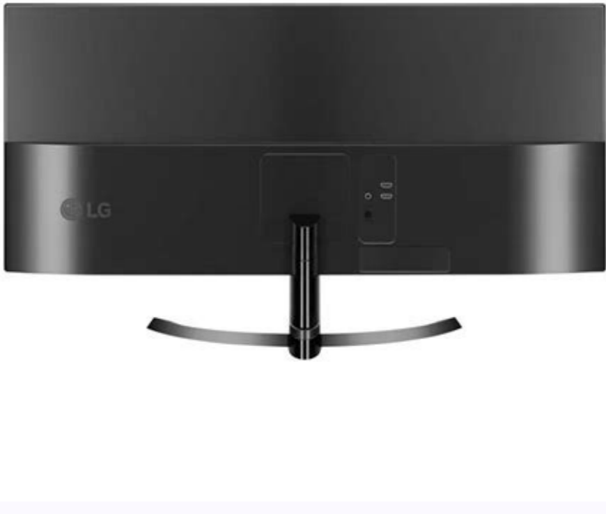
Lg 32ul500 review. Lg 34um61-p review. Lg 25um65-p review. Lg 27mp48hq-p review.